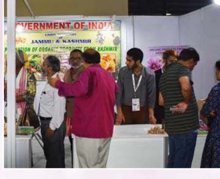
JAMMU & KASHMIR